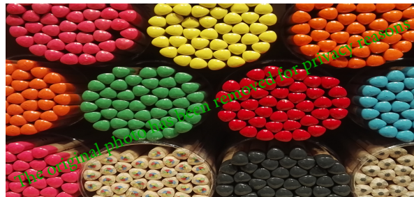
Symposium 'Women scientists at the CRC – Learn, Network, Catch up', June 2015