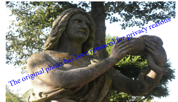
Excursion with the holiday childcare group

and in our brochure titled 'On Your Side'.