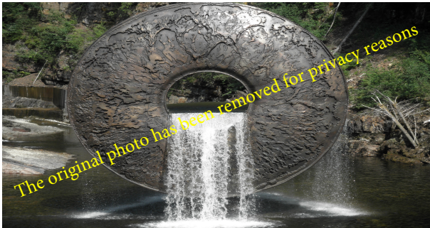
Participants „Scientific Writing“ 2016