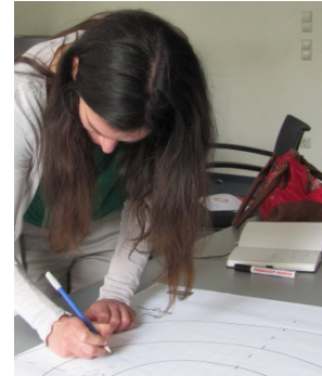
Scientist at a workshop in 2015