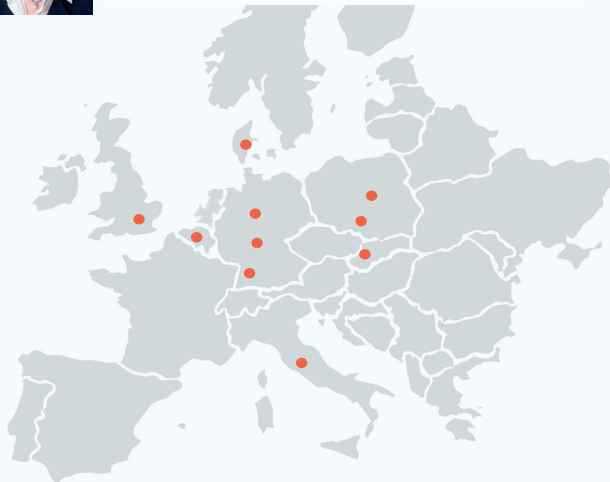
● Centers of the Subnetwork Familial Leukemia

EUROPEAN REFERENCE NETWORKS FOR RARE, LOW-PREVALENCE AND COMPLEX DISEASES